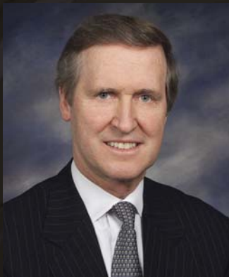
William S. Cohen Former U.S. Secretary of Defense, CEO of The Cohen Group, & Board Director at CBS Corporation